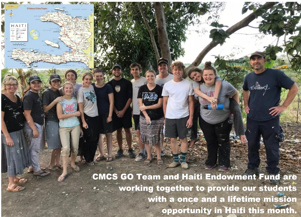
CMCS GO Team and Haiti Endowment Fund are working together to provide our students with a once and a lifetime mission opportunity in Haiti this month.